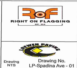
Figure # 7.8 in the TCMWR 2015 Edition Single Lane Alternating This Traffic Control Plan is designed to accommodate patch work on Spadina Ave. There are two patches at this location Work to commence Monday, Aug. 13th, 2018 and is expected to be completed in one day, however permit will be requested for a week Work hours shall be from 7:00 am - 5:00 pm All signs and traffic devices shall be placed in compliance with WCB and the TCMWR